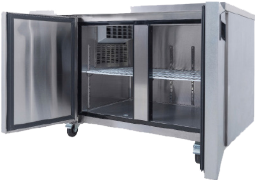
Optional splash back